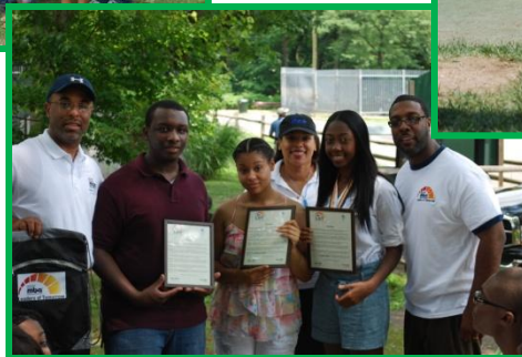
Leaders received awards and proclamations for their hard work and dedication throughout the year